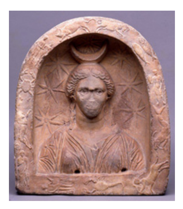
Goddess crowned by moon and surrounded by stars in a zodiacal naos, Argos, Greece, late pagan era.

More background on Khokhmah can be found in this earlier version: http://www.suppressedhistories.net/articles/sophia.html