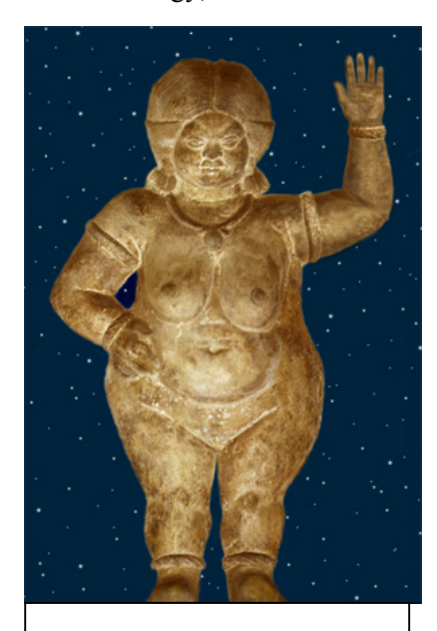
Barbelo? Egyptian ceramic, 100-300 CE (right arm reconstructed)